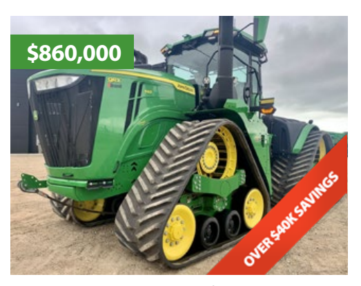
2022 JOHN DEERE 9RX 540, Stk: 1AU20587, Eng Hrs: 1128, Signature Edition, 36"Tracks, PTO, SF 6000 receiver, High flow dual pumps ......ROSTHERN, SK