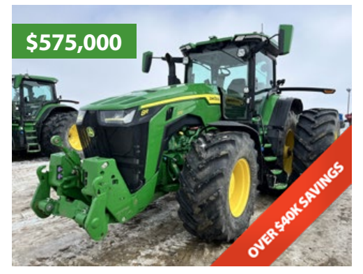
2022 JOHN DEERE 8R 370, Stk: 2AU03529, Eng Hrs: 1450, Frnt 3 Point hitch w/ 2 Hydraulics Sig. Edition 50K IVT, ILS suspended front axle RED DEER COUNTY, AB