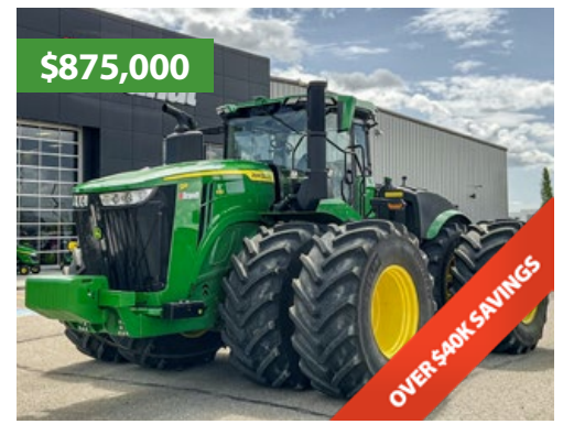
2023 JOHN DEERE 9R 540, Stk: 1AU81943, Eng Hrs: 112, Signature Edition, 1000 PTO, High Flow Hydraulics, Automation 4.0 with Receiver...... ROCKY VIEW, AB