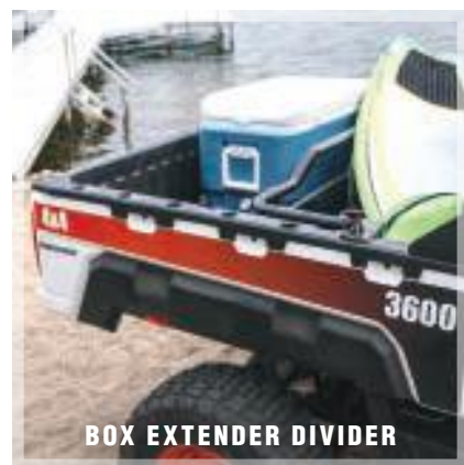
BOX EXTENDER DIVIDER

A wide variety of options lets you customize your Bobcat utility vehicle for the jobs you do – or tailor it to your personal style.