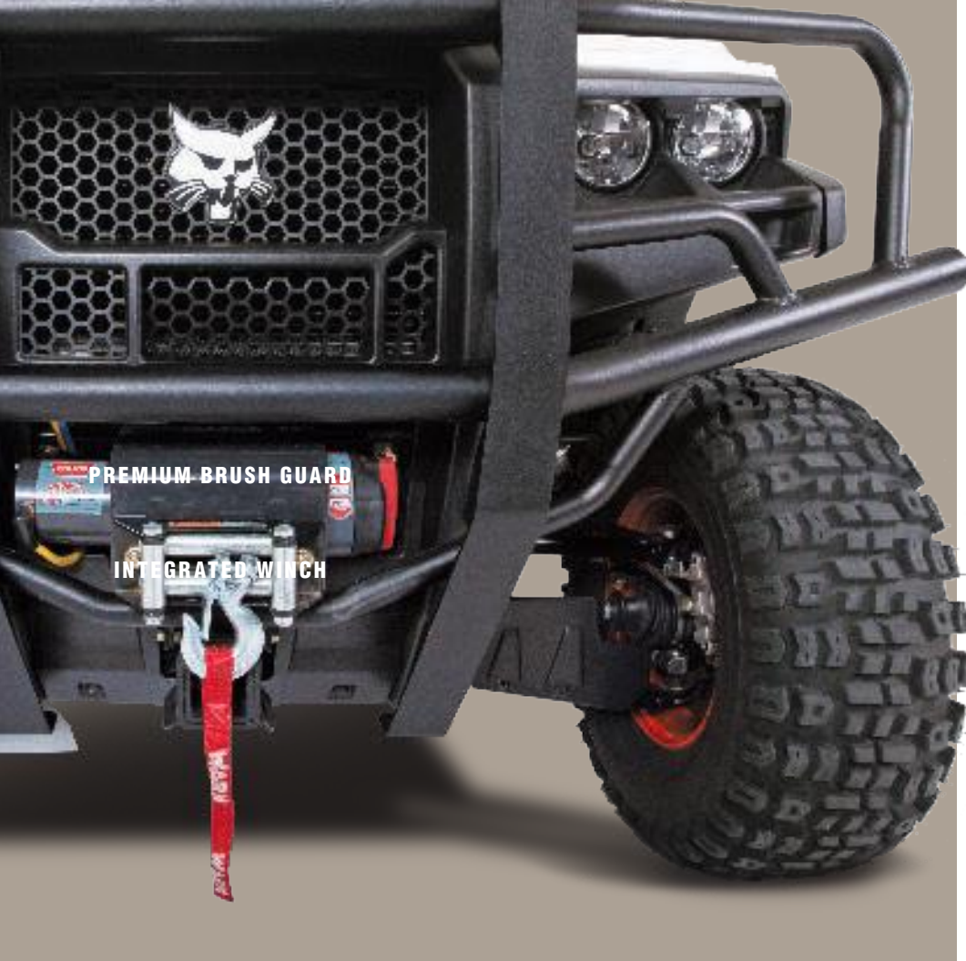
PREMIUM BRUSH GUARD