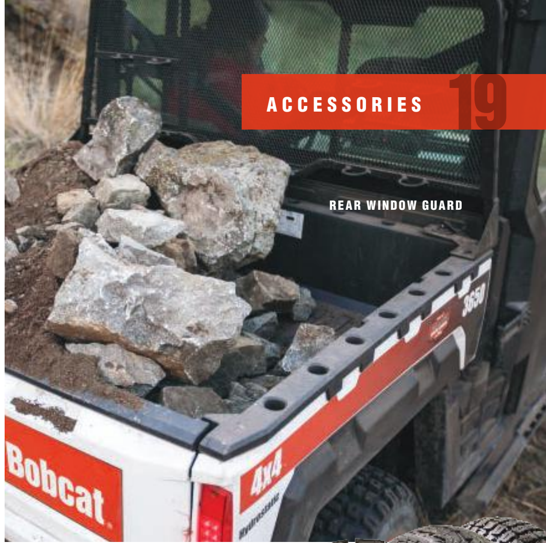
REAR WINDOW GUARD

It's not PERFECT until it's PERFECT FOR YOU.