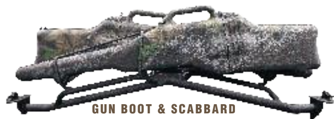
GUN BOOT & SCABBARD

A wide variety of options lets you customize your Bobcat utility vehicle for the jobs you do – or tailor it to your personal style.