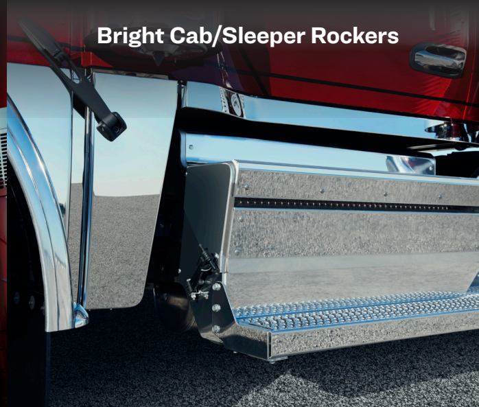
Bright Cab/Sleeper Rockers