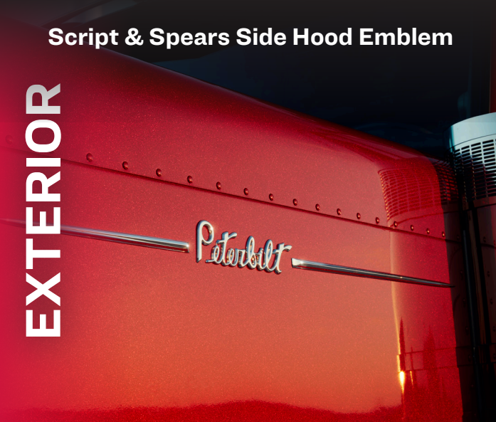
Script & Spears Side Hood Emblem