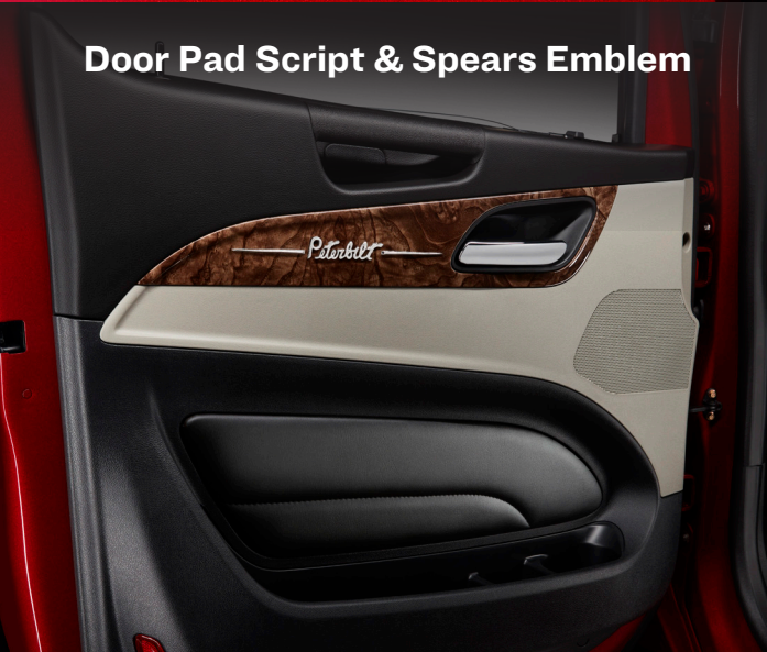
Door Pad Script & Spears Emblem