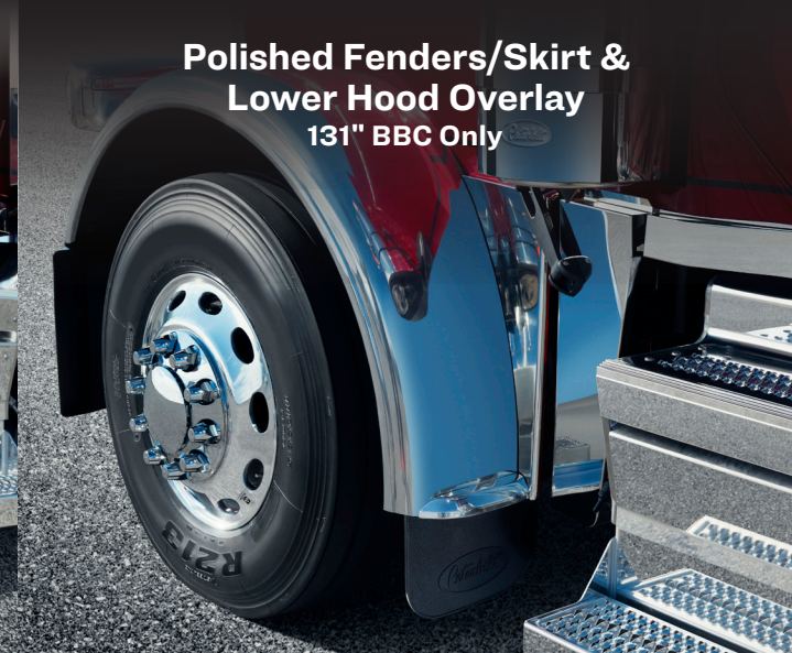
Polished Fenders/Skirt & Lower Hood Overlay 131" BBC Only